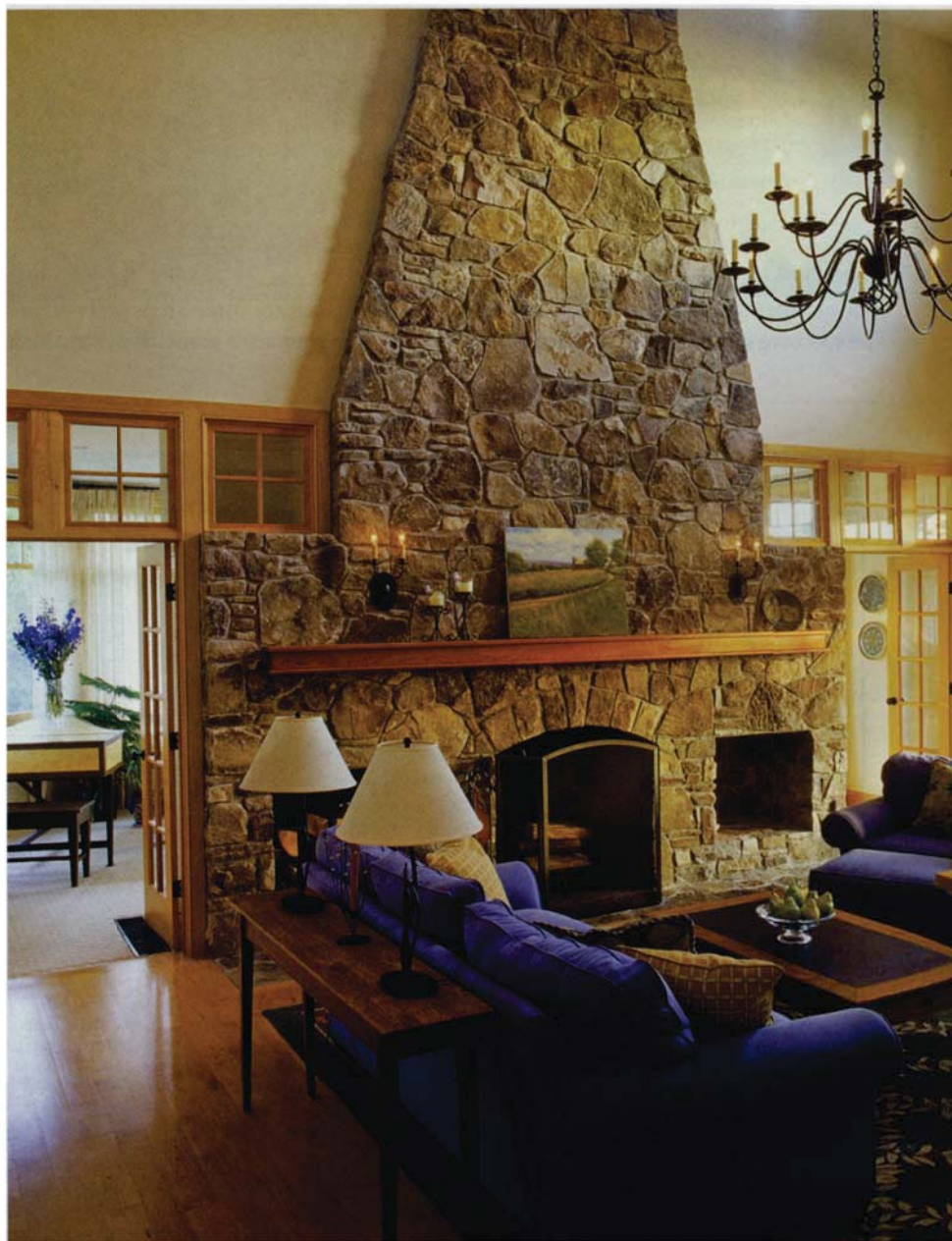
A private residence in Shelburne: Interior design and architecture by Burlington's Truex, Cullins & Partners